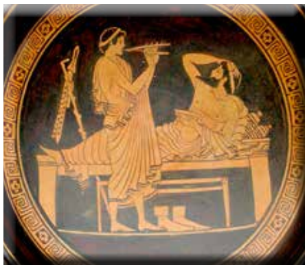
Note that the reclining man shown on this cup has put his shoes underneath this couch and that the musician is barefoot. Both men wear headbands.