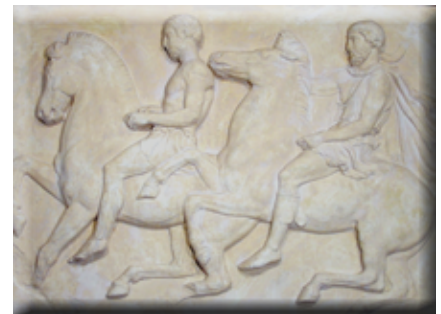
Horsemen in chitons from the Parthenon frieze.

Working men, who needed greater ease of movement, wore a chiton. Unlike women's chitons, those of men went only to the knees. As shown on the frieze sculptures here, the men could, if desired, attach the top of the cloth at one shoulder only or tuck the top of the cloth into the waist belt.