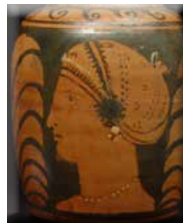
A woman with her hair wrapped in a scarf.