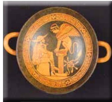
Oedipus is dressed for travel in his wide-brimmed hat, cloak, and shoes.